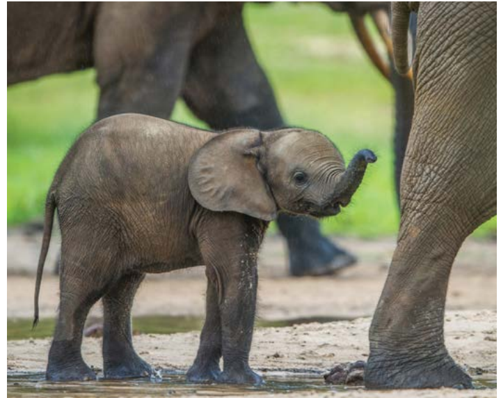
REPUBLIC OF CONGO – 2004: Forest elephant populations in the Sangha Tri-National Landscape are growing with the help of USAID's conservation efforts.

USAID partners with key regional organizations, such as the Congo Basin Forest Partnership (CBFP), which promotes the sustainable management of the Congo Basin's forests and wildlife by improving communication, cooperation and collaboration; and with regional bodies, including the Central African Forests Commission (COMIFAC), to coordinate common approaches to avoid trans-border "migration" of the drivers of deforestation, forest degradation and biodiversity loss due to differences in national policies and technical implementation capabilities. 3