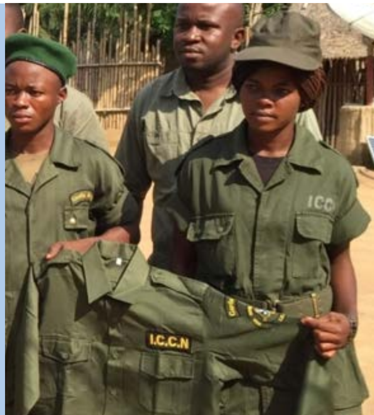
DEMOCRATIC REPUBLIC OF THE CONGO – 2014: Eco-guards receive equipment in Maringa-Lopori-Wamba Landscape.