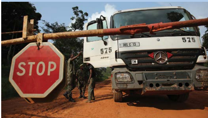
DEMOCRATIC REPUBLIC OF THE CONGO – 2012: Eco-guards check a logging truck in the Nouabalé-Ndoki National Park buffer zone.