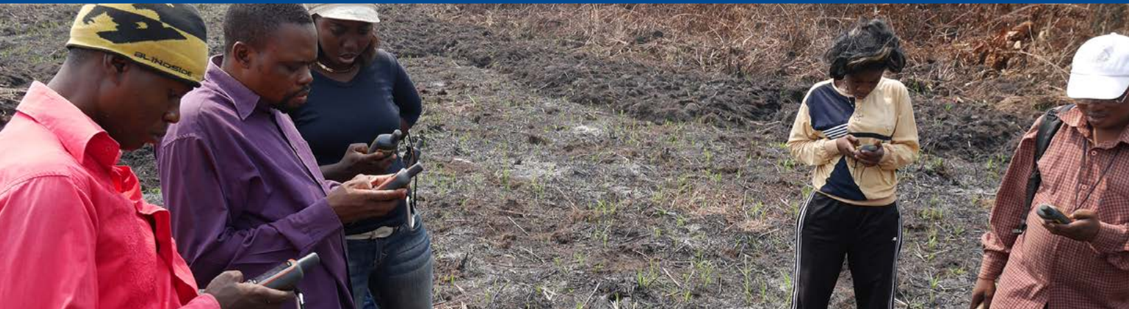
DEMOCRATIC REPUBLIC OF THE CONGO, BANDUNDU PROVINCE – 2014: Provincial authorities from the Office for Environmental Coordination learn how to identify and map deforestation hot spots with USAID's support.