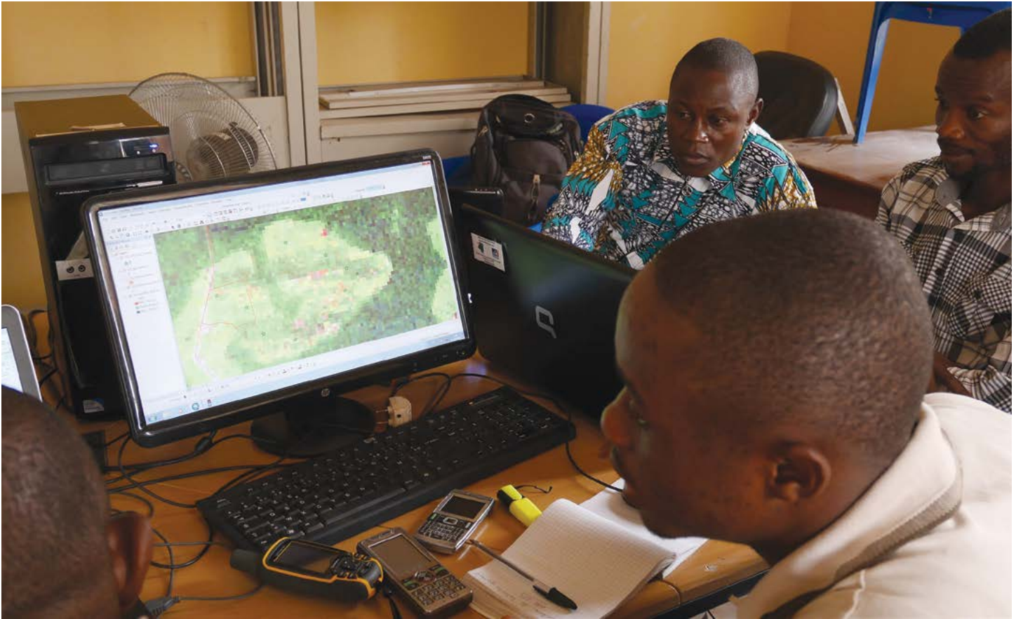
DEMOCRATIC REPUBLIC OF THE CONGO, MBANDAKA PROVINCE – 2014: USAID supported a technical training session for Directorate of Forest Inventory and Planning personnel – the people in charge of collecting data on artisanal cutting permits.

It also works with civil society organizations, ensuring that citizens have the right and ability to influence decisions about the natural resources that sustain their communities, and supporting legal analysis of sector law and conflicts between land uses and policy and regulatory framework development.