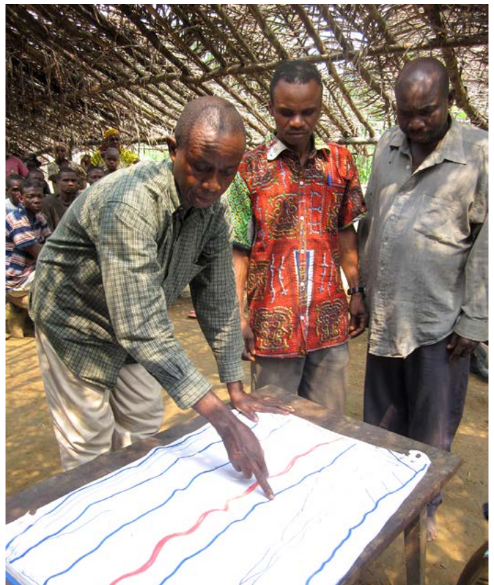
DEMOCRATIC REPUBLIC OF THE CONGO – 2010: A village leader locates features on a hand-drawn community map as part of a participatory zoning and mapping exercise led by USAID's field partner in the Maringa-Lopori-Wamba landscape.