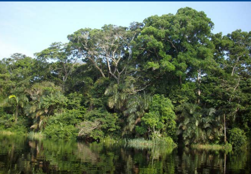
DEMOCRATIC REPUBLIC OF THE CONGO – 2010: Forests along the Maringa River in the Maringa-Lopori-Wamba landscape.