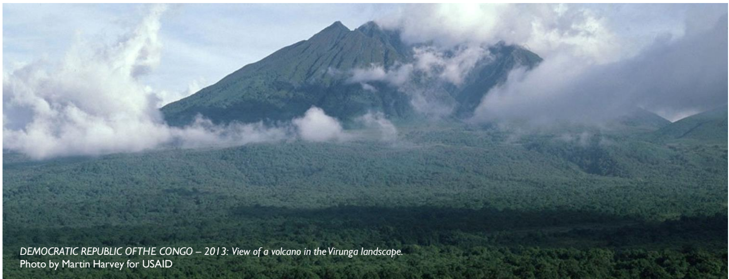
DEMOCRATIC REPUBLIC OF THE CONGO – 2013: View of a volcano in the Virunga landscape.

Potential flashpoints for conflict are reduced by working with local communities to demarcate agreed boundaries. This participatory process, which has been in effect since 2003, is helping to resolve potential disagreements before they start by clearly differentiating between protected areas, community managed land and other land.