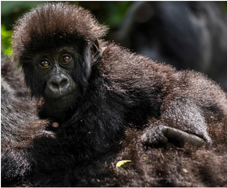
DEMOCRATIC REPUBLIC OF THE CONGO – 2013: A new member of the Bageni family in the gorilla sector of Virunga National Park.