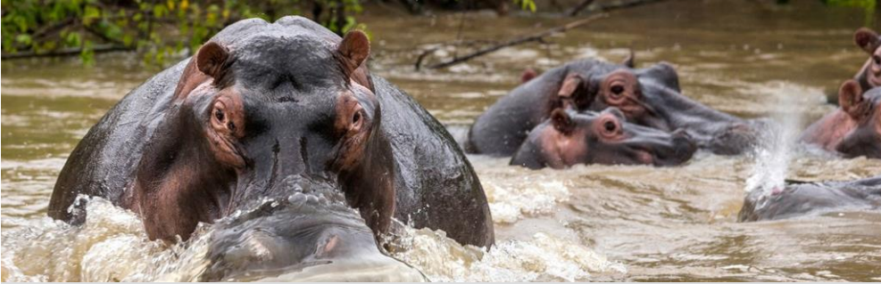
DEMOCRATIC REPUBLIC OF THE CONGO (DRC) – 2013: USAID’s interventions in and around Virunga National Park are helping to protect the dwindling hippo populations.