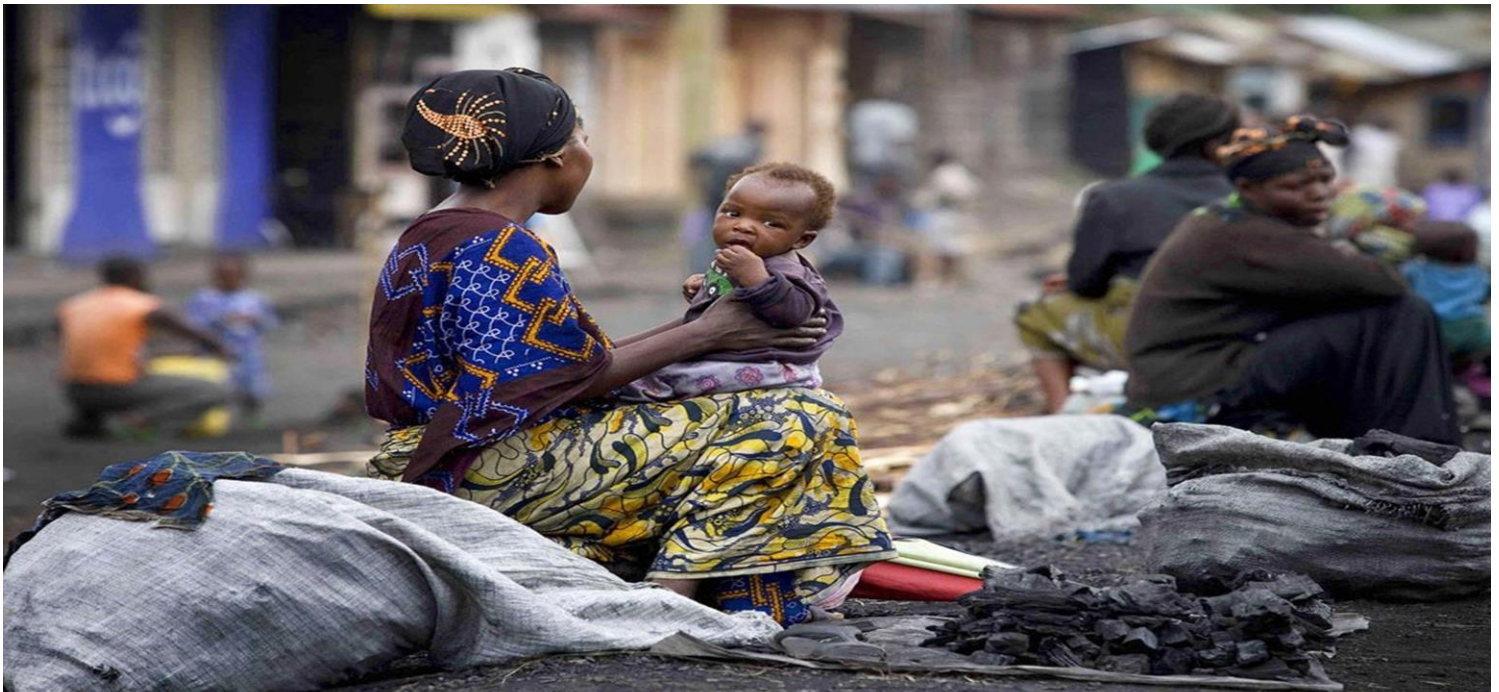
DEMOCRATIC REPUBLIC OF THE CONGO – 2008: Woman selling charcoal in market near Virunga National Park.