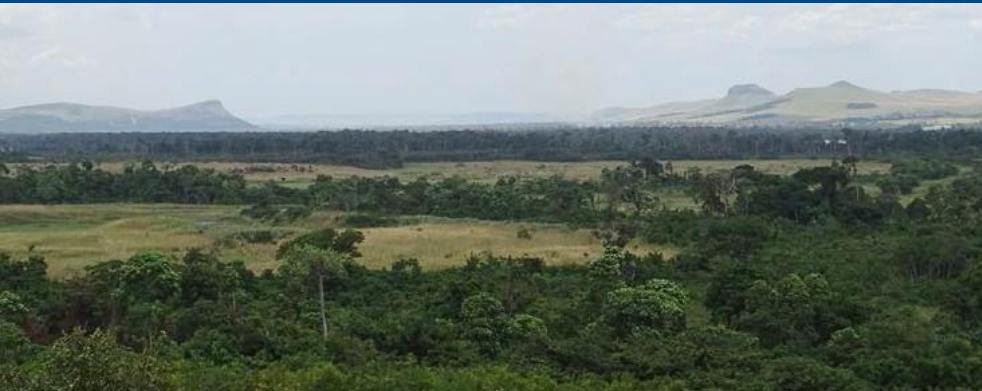
REPUBLIC OF CONGO – 2015: A view of the Lefini Valley.