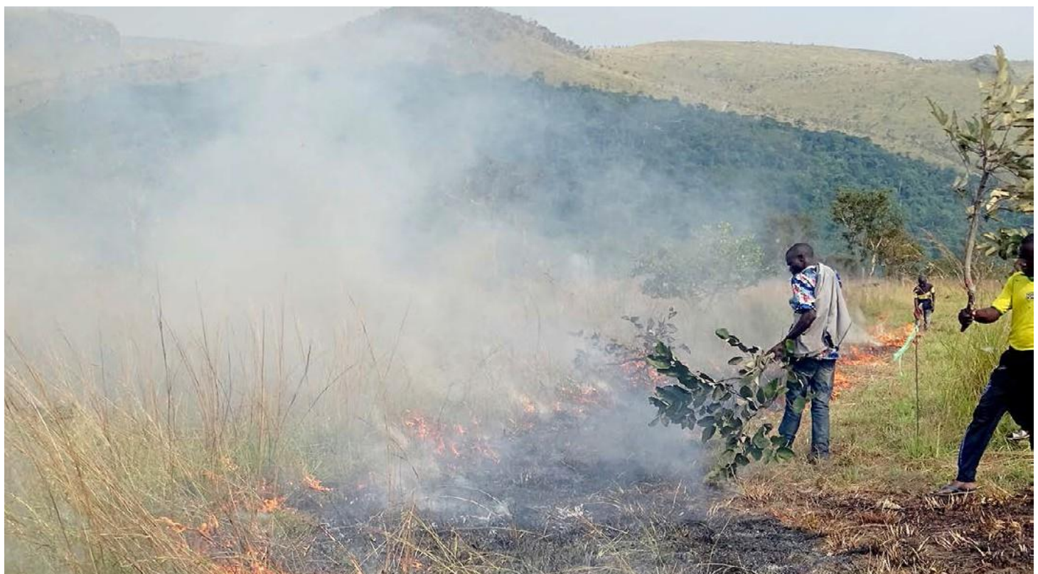
REPUBLIC OF CONGO – 2015: Controlled, early burning in an experimental fire management plot established in the Léfini Faunal Reserve.