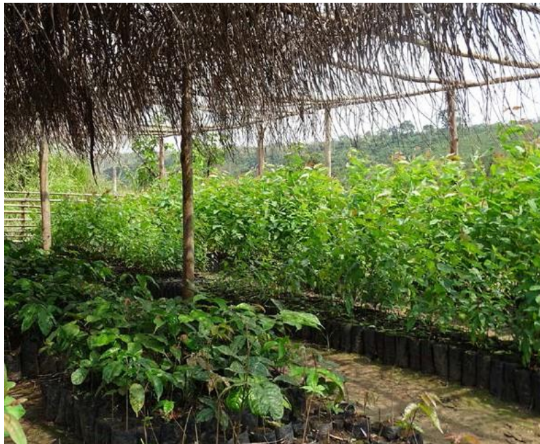
REPUBLIC OF CONGO – 2015: Community members are producing fast growing tree species in the Mpama tree nursery on the Batéké Plateau.