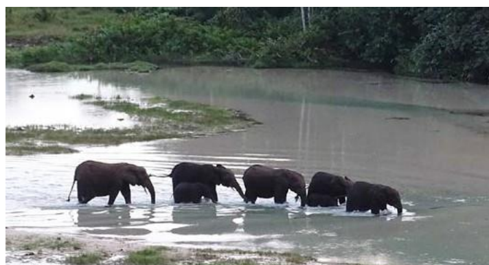
REPUBLIC OF CONGO – 2015: CARPE's support has been instrumental in preserving a remnant population of forest elephants.

Batéké-Leconi-Léfini has an unusual potential for sustainable development due to its relative proximity to Brazzaville (about 100 kilometers south), its well-organized communities and its open habitat, which means that it is possible to develop several economically viable activities, including the generation of carbon credits, commercial livestock production, agroforestry and tourism, resulting in a healthy balance of community and commercial interests and conservation priorities.