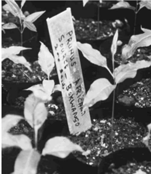
Figure 1: Prunus seedlings at the Limbe Botanic Garden

Though harvested primarily by rural people, urban dwellers and the African diaspora in Europe and North America drive market demand for NTFPs. In urban markets Gnetum africanum leaves, called Eru in Cameroon, sells for U.S. $0.47/kg, which is almost three times the price of a cultivated alternative called bitter leaf ( Vernonia amygdalina or Ndole). Though African diaspora in Europe and the United States are willing to pay U.S. $50/kg for air-freighted Eru, the volume of trade is tiny relative to that supplying the national and cross-border markets. Interestingly, high demand for NTFPs spices has driven up prices such that some families are now substituting the much less expensive Maggi seasoning in their cooking.